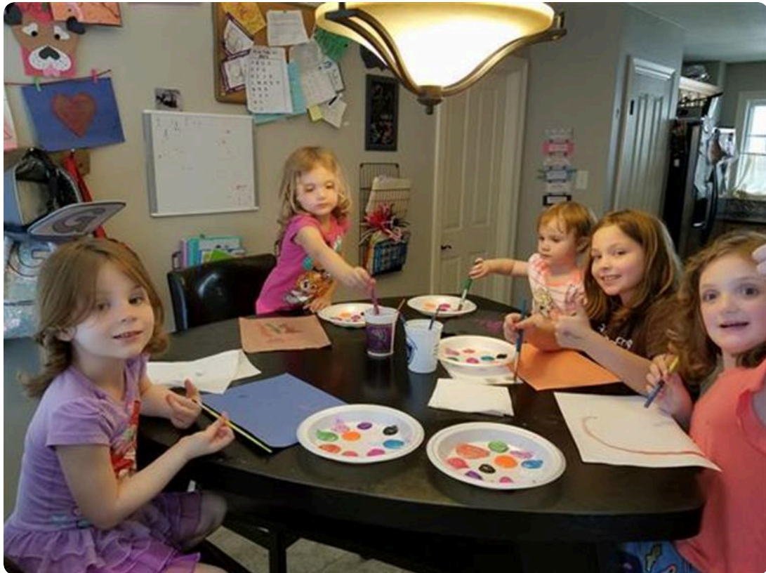
Rose's "beautiful Babies"