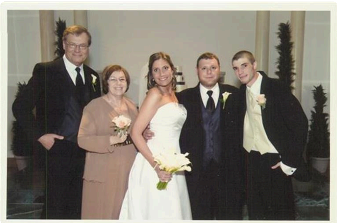
From Heather's Wedding