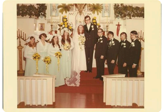
Our Wedding 4/28/73